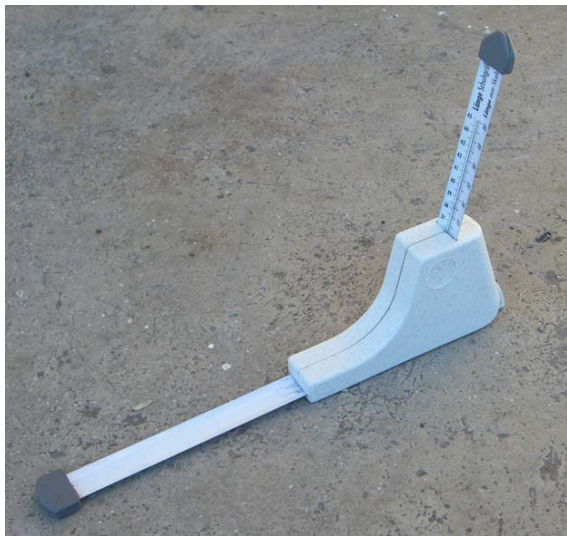
Figure 3 Measuring device for the inside length of shoes.

imum of Nagelkerke's R^2 starting with one degree hallux angle and increasing the angle by one degree at each step.