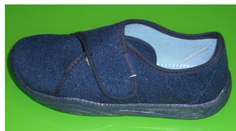
Figure 2 Typical Austrian pre-school indoor shoe.

To test the functional association between hallux angle and the fit of shoes, a logistic regression analysis was performed with "fit" for street and indoor shoes as forced inclusion variables, and gender, age, body weight and body mass index as stepwise inclusion variables. For relative risk calculation, a cut off point of \geq 4 degrees hallux angle was used. The cut-off was chosen based on the max-